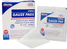
Gauze & Non-Woven Dressings