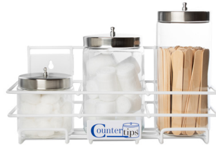
Exam Room Supplies