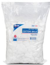
Applicators & Swabs