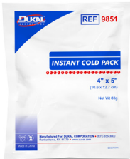
Hot & Cold Packs