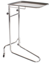
Exam Room Equipment