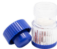
Exam Room Supplies